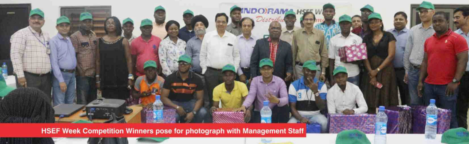
HSEF Week Competition Winners pose for photograph with Management Staff