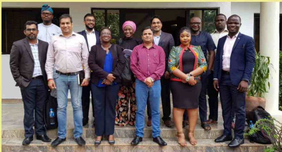
Group photograph taking after the meeting between the Executives of Indorama and the Partners-OCP and IBM in Abuja.

Indorama Fertilizer is working in partnership with International Business Machines (IBM) Corporation and Office Chérifien des Phosphates (OCP), the Moroccan world's largest phosphate fertilizer manufacturing company, with an annual production of 14 million metric tons, to boost agriculture in Nigeria.