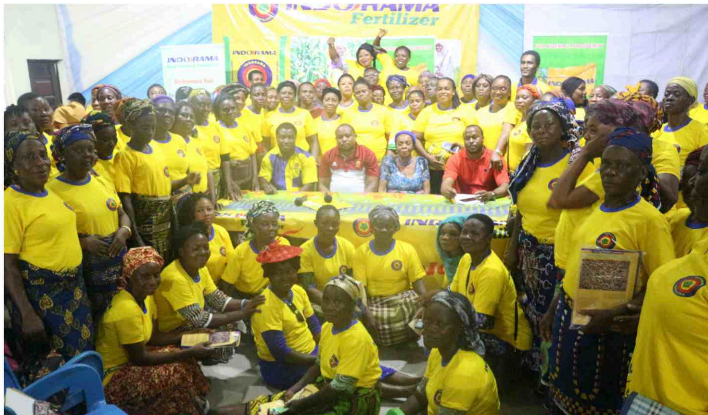
■ Female farmers from Eleme communities in a group photograph with Indorama staff after the training.