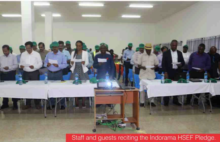
Staff and guests reciting the Indorama HSEF Pledge.