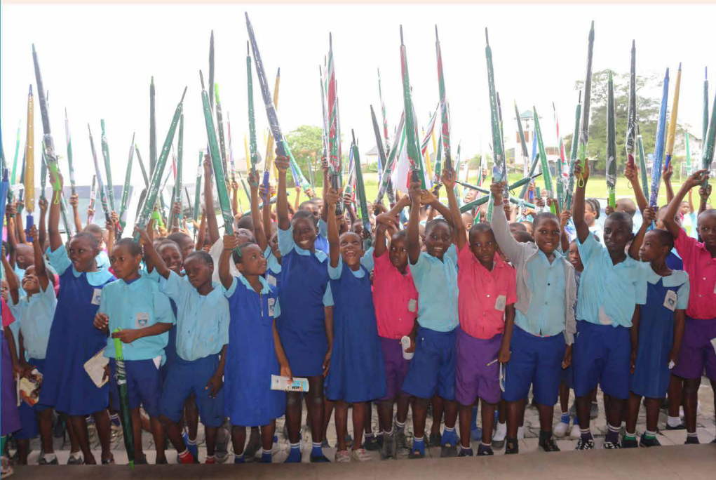
Students of State Primary Schools 1 & 2 excitedly display branded gifts from the WED activities.

corroborate with a reputable, caring and philanthropic multinational organizations like Indorama to celebrate this 2023 World Environment Day. We thank you for lavishing your resources on our development and advancement.”