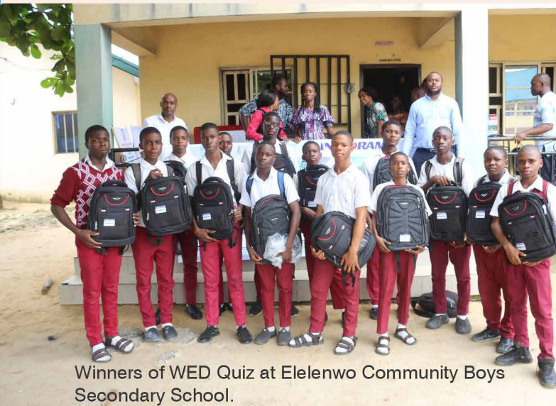
Winners of WED Quiz at Elenwo Community Boys Secondary School.