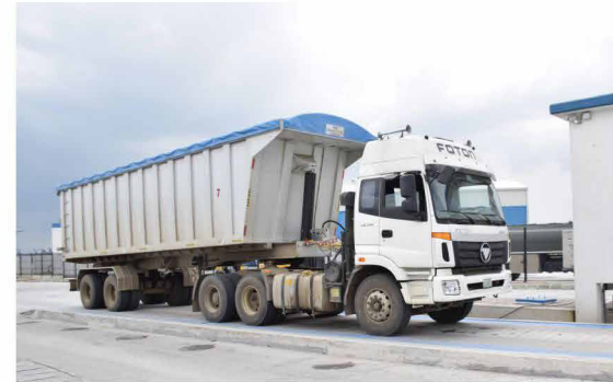
Truck conveying bulk Urea to the port

valued at N178.8 billion ($387.8 million) from Nigeria this year; India needs 11 million tonnes, Brazil requires 7.1 million tonnes, the US needs 4.5 million tonnes, Turkey needs 2.5 million tonnes, Australia needs 2.4 million tonnes and Thailand needs 2.4 million tonnes," Said ChemAnalyst.