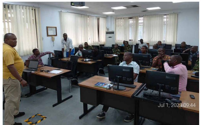
Indorama Security personnel in the Classroom