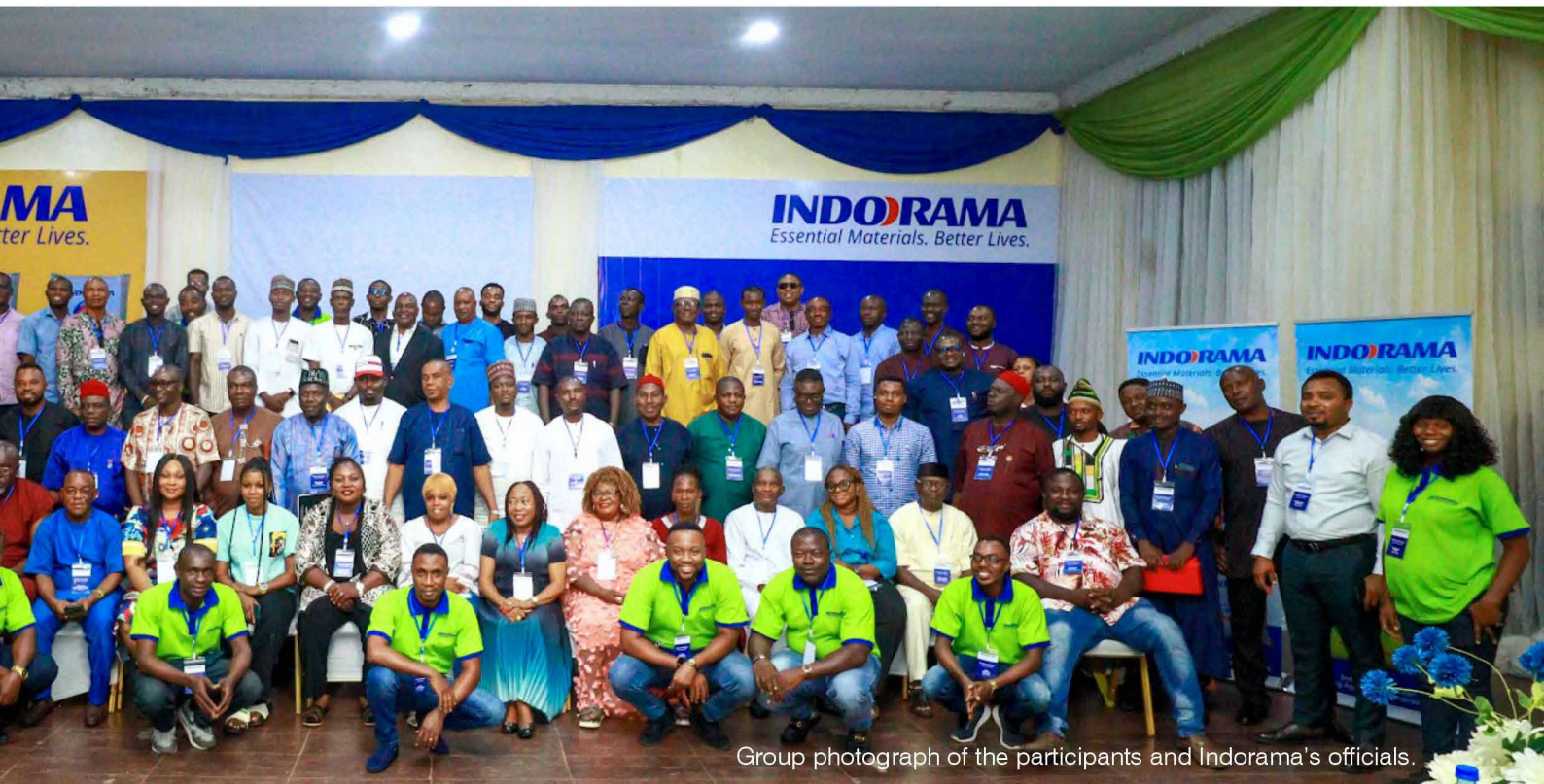
Group photograph of the participants and Indorama's officials.

Cornel Agro Business Ventures, Eddyibanga International Nig. Ltd and Ashifaq Logistics Ltd took home the awards in Akure region, while Samorason Integrated Ltd, Muhzah Oil and Gas Ltd, Zah-Kushu Logistics Services Limited were the awardees in Calabar region.