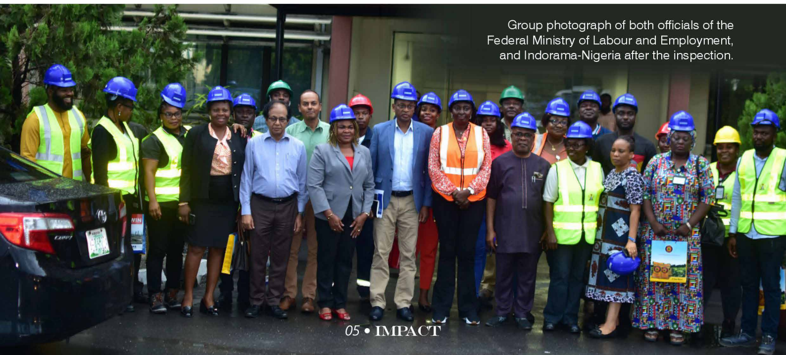
Group photograph of both officials of the Federal Ministry of Labour and Employment, and Indorama-Nigeria after the inspection.