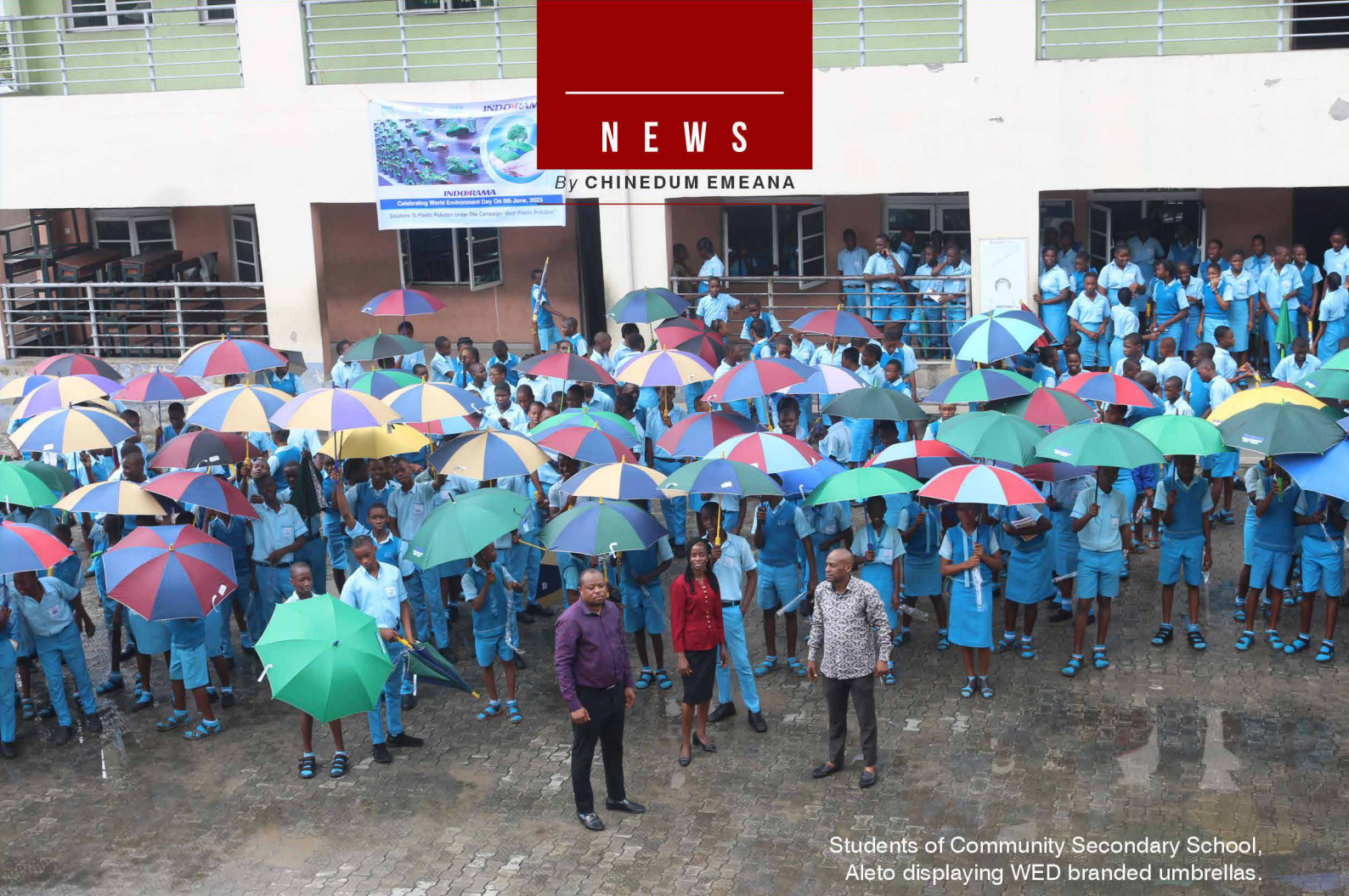
Students of Community Secondary School, Aleto displaying WED branded umbrellas.