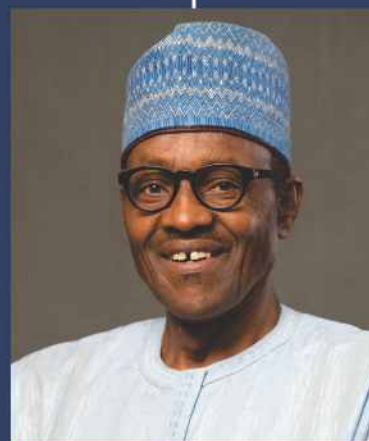
President Muhammadu Buhari Federal Republic of Nigeria