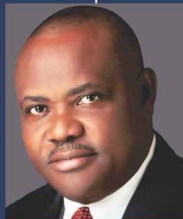
Governor Nyesom Wike Rivers State