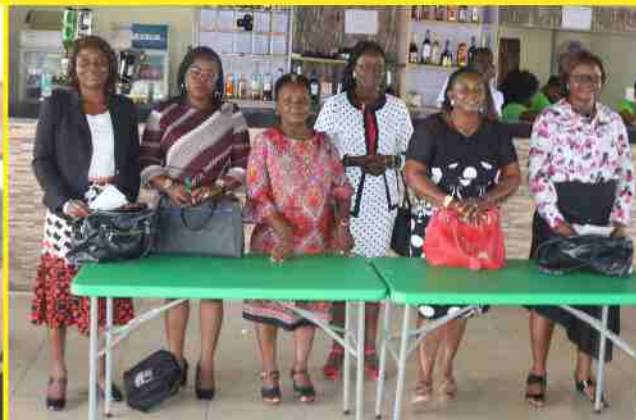
The Judges: professionals and independent