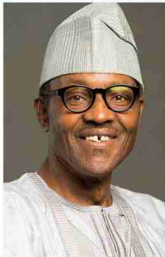
Muhammadu Buhari President Federal Republic of Nigeria

As we did last year, Indorama is also organizing special events to mark the Day. They