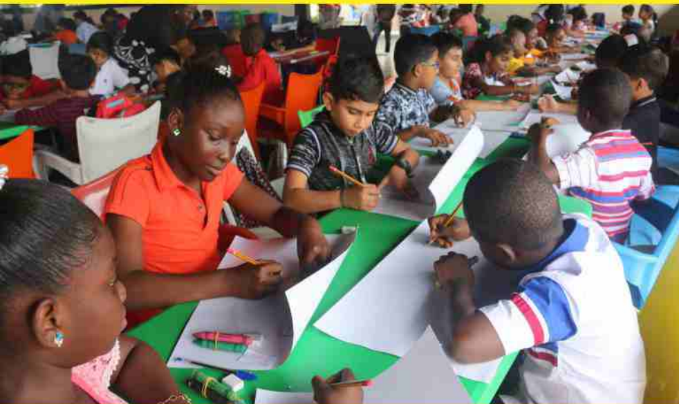
Serious work! Children participating in the competition busy with their pens, pencils and crayons!

The management of Indorama-Nigeria in pursuit of its "Catch Them Young" initiative organized an Essay and Drawing competition amongst the children of employees on 25th August 2018 at the Indorama Recreational Club, inside the Company complex. The competition involved pupils in Primary school as well as students in junior and senior secondary school.