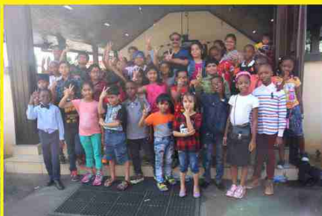
Group photo of the happy children after the competition