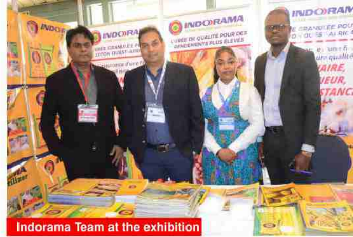
Indorama Team at the exhibition

is helping to address the issue of hunger and food insecurity in the country. Besides, Indorama exports about half of its total production, thereby making Nigeria a net exporter of fertilizer.