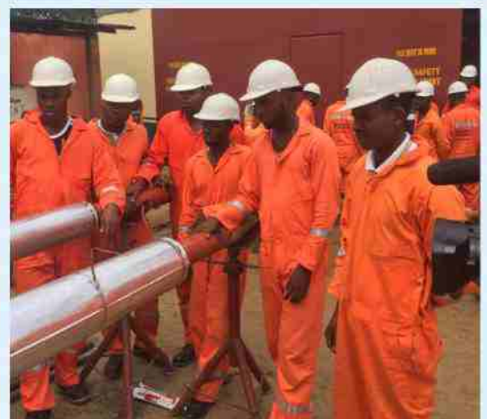
Some of the participants at the workshop learning the skills

Iron Bending, Grinding and Rigger training and Hairdressing for females.