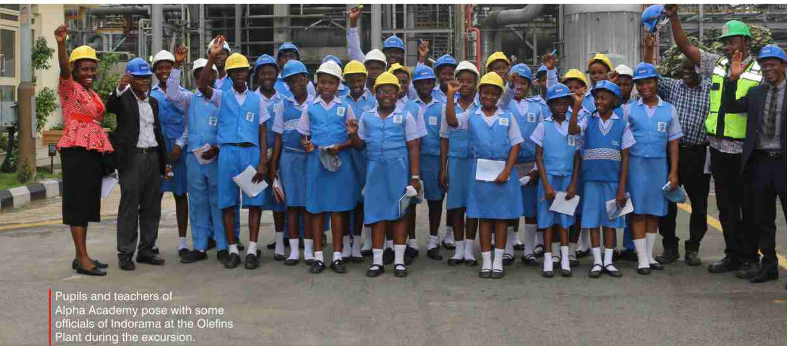
Pupils and teachers of Alpha Academy pose with some officials of Indorama at the Olefins Plant during the excursion.